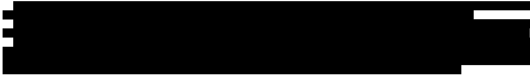
Process Renovapet (RECYC271) based on the VACUNITE (EREMA basic and Polymetrix SSP V-lean) technology

*Without external heating in a crystallisation silo; temperature > [redacted], > [redacted].